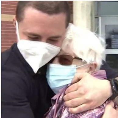
A 90-year-old had not been able to see her grandson, and EMT, for over a year due to the pandemic – until he was able to give her a vaccine.