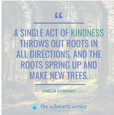
"A single act of kindness throws out roots, in all directions and the roots spring up and make new trees."