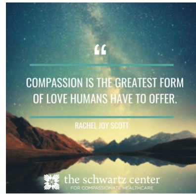
"Compassion is the greatest form of love humans have to offer."