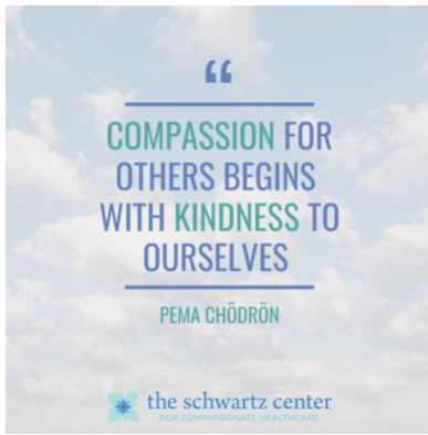
"Compassion for others begins with kindness to ourselves."