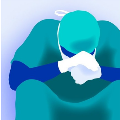
The Surgeon General's new Advisory addresses the health worker burnout crisis.