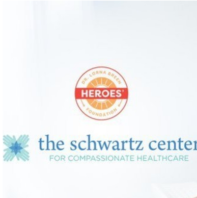
Learn more about how we are working together to change our healthcare system.