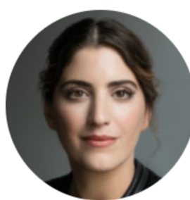
Suleika Jaouad Emmy Award-winning journalist, TED speaker and author of bestselling memoir, "Between Two Kingdoms"