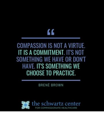
<u>Compassion is not a virtue. It is</u> <u>a commitment. It's not</u> <u>something we have or don't</u> <u>have. It's something we choose</u> <u>to practice.</u>