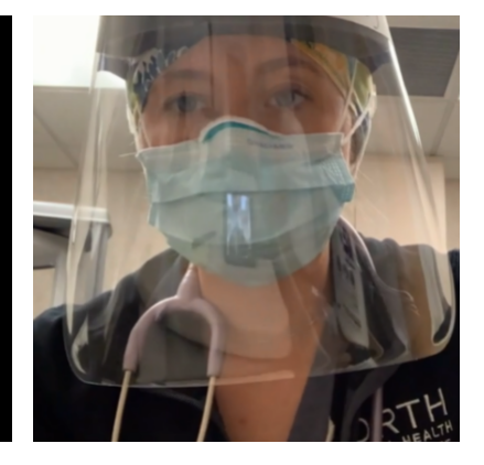
<u>Caregivers discuss the</u> pandemic's mental health toll, and fears that some frontline healthcare workers face over seeking help.