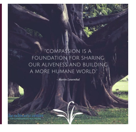
"Compassion is a foundation for sharing our aliveness and building a more humane world."

More than 60% of frontline healthcare workers say the pandemic has negatively impacted their mental health. All In seeks to support caregiver well-being in light of these statistics.