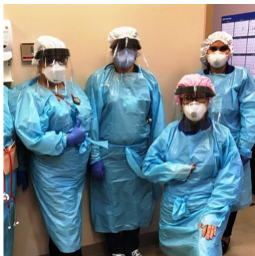
Learn more about the work being funded by our friends at All In: Wellbeing First for Healthcare